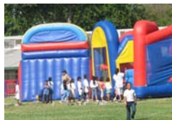
Finale Event, May 2008

members visited several of the school sites to provide the children with incentives they had earned. The Coalition held the Finale Event in May. The acknowledged the children for all of their hard work and dedication to the Walk It Out Project .