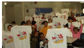
Site Visits, February 2008

During 2008, the Coalition maintained their sponsorship of the Walk It Out Project in five Modesto City Schools After-School Program sites. In February, Coalition